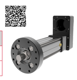
FTX Series — Hydraulic Cylinder Replacement Applications (for use with a variety of motors and gearboxes)