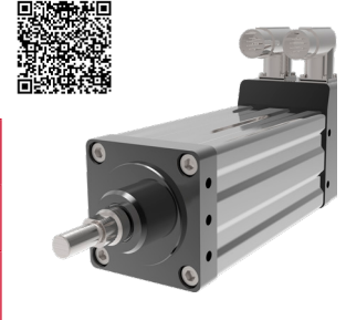
GTW Series — Automotive Weld-Gun Applications