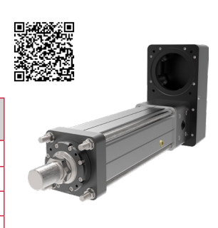
KX Series — Pneumatic Cylinder Replacement Applications (for use with a variety of motors and gearboxes)